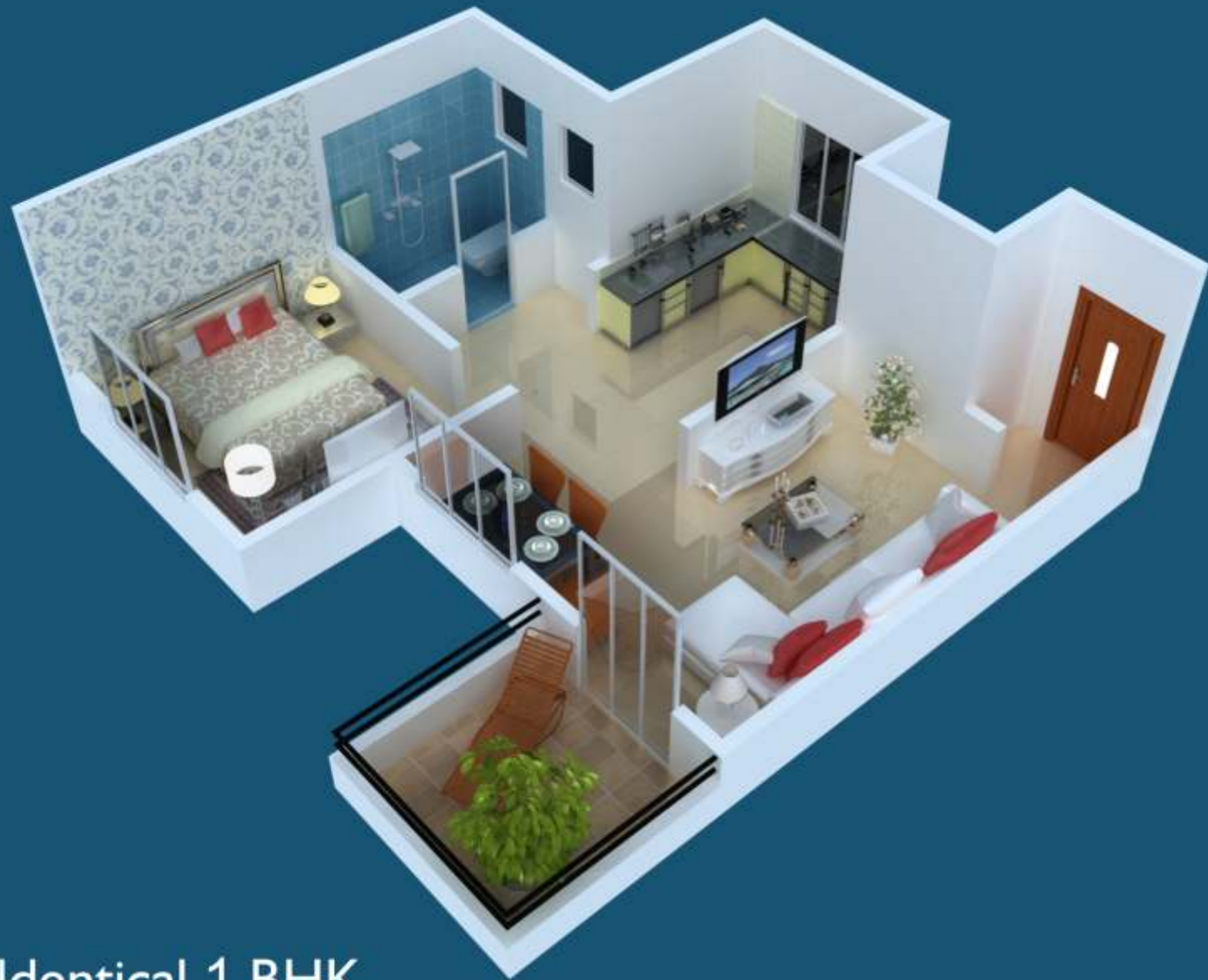
Identical 1 BHK