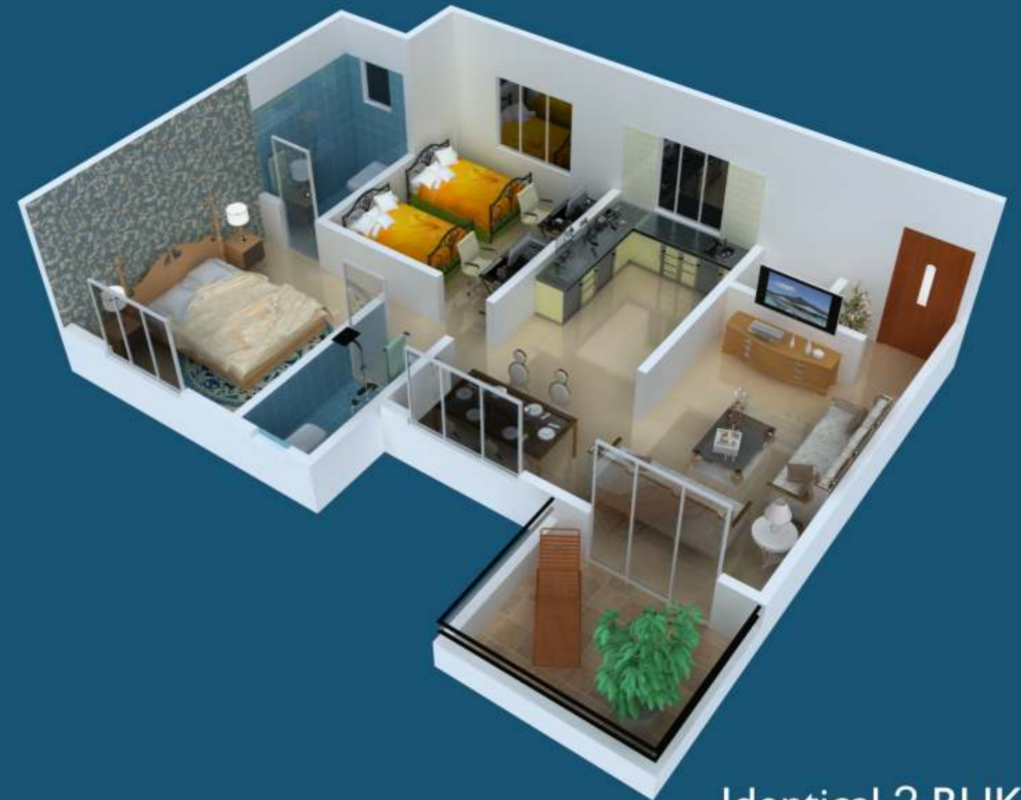
Identical 2 BHK